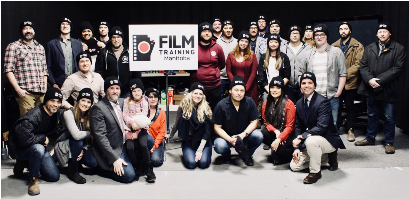
FTM Film Expo